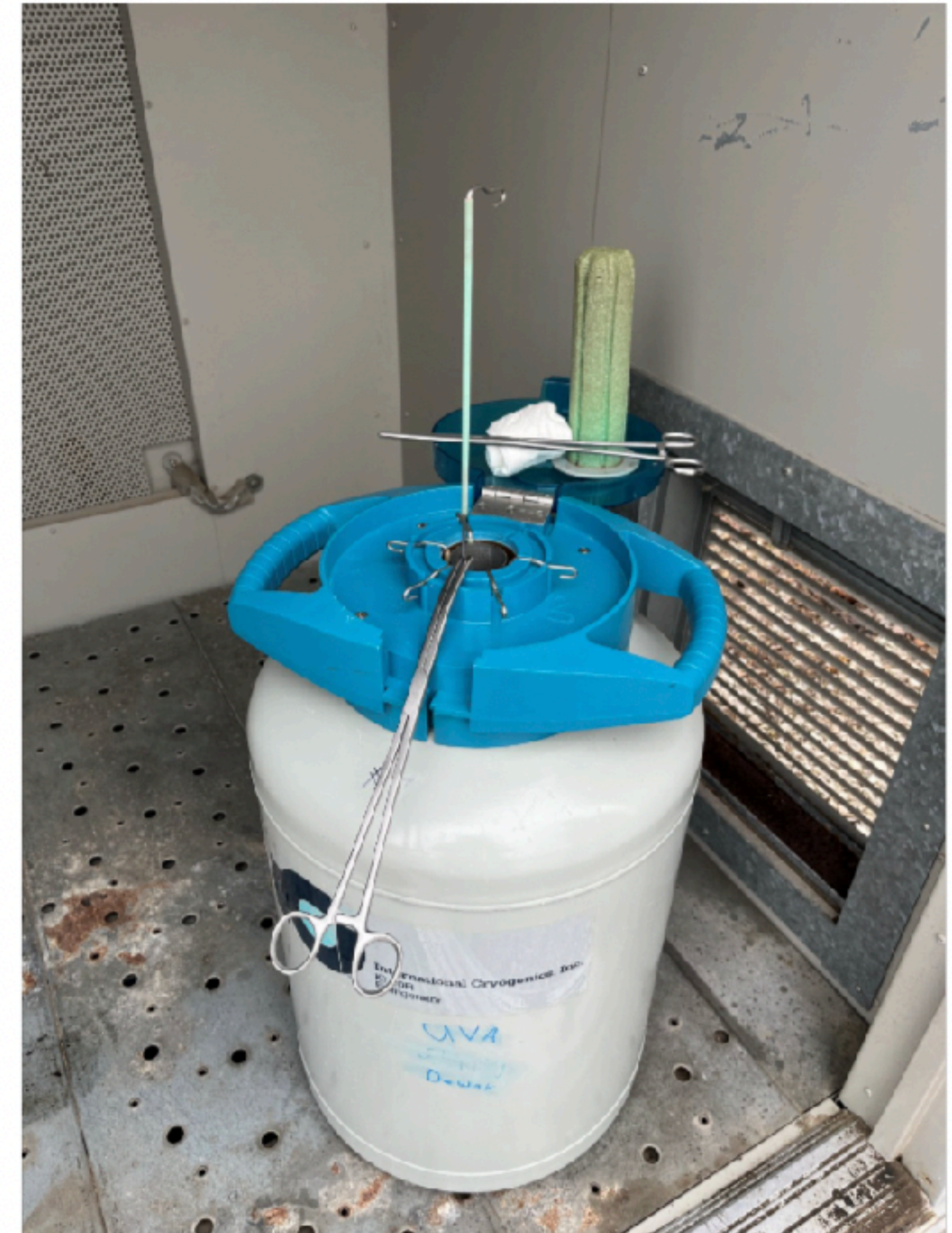
Put away the paper towel and tweezers