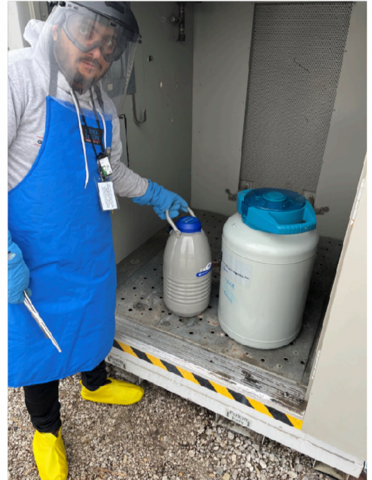
Keeping the Dewars in the outside storage shed