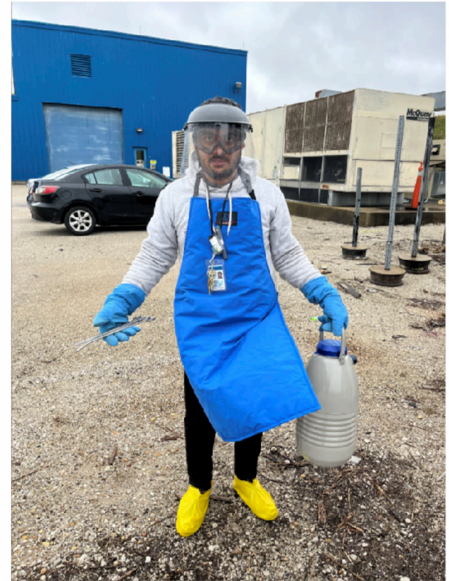
Transferring the material between NM4 and outside storage shed