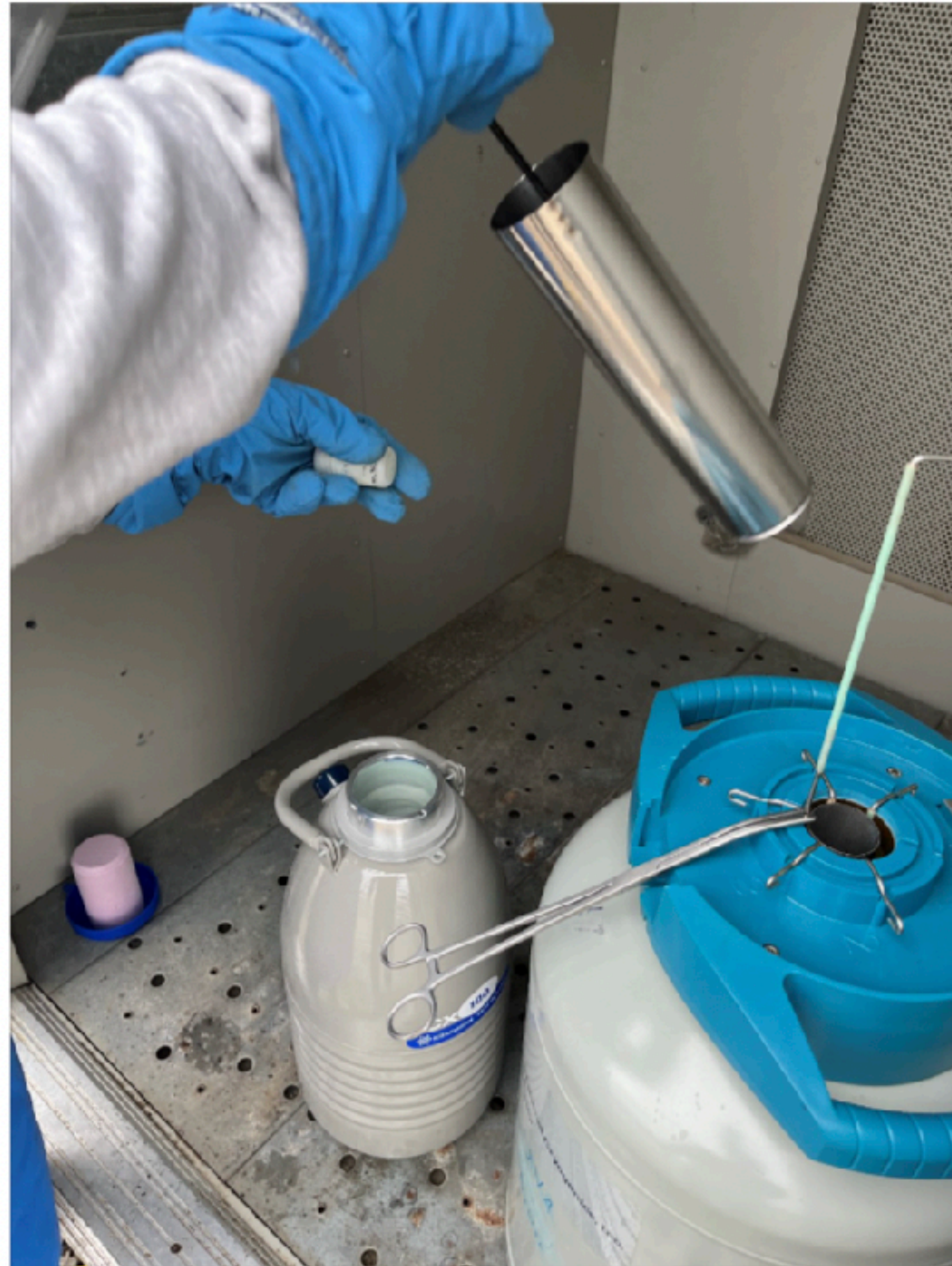
Holding the target material in the hand