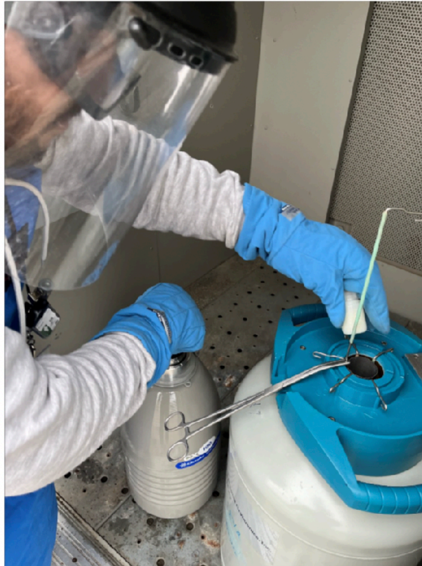
Placing the target material in the storage Dewar canister