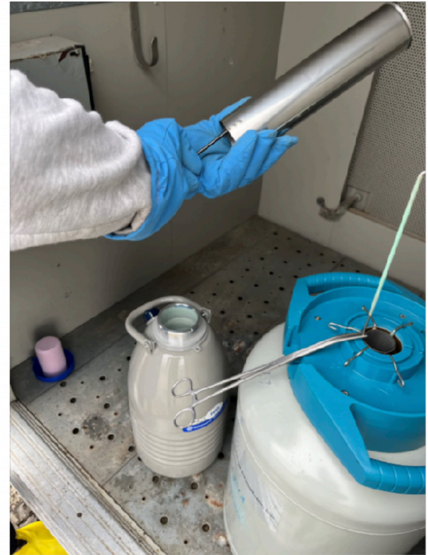
Placing the target material on the hand