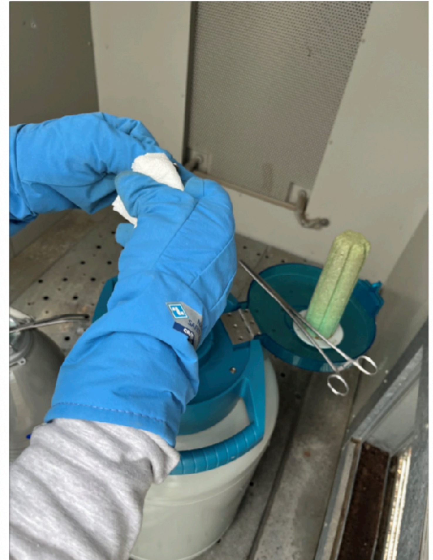
Putting the paper towel in the canister