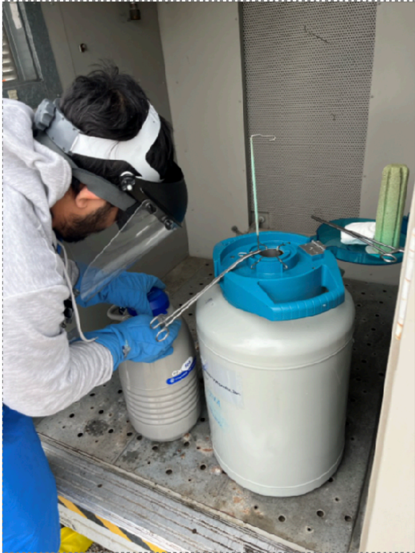
Removing lid from the shipping Dewar