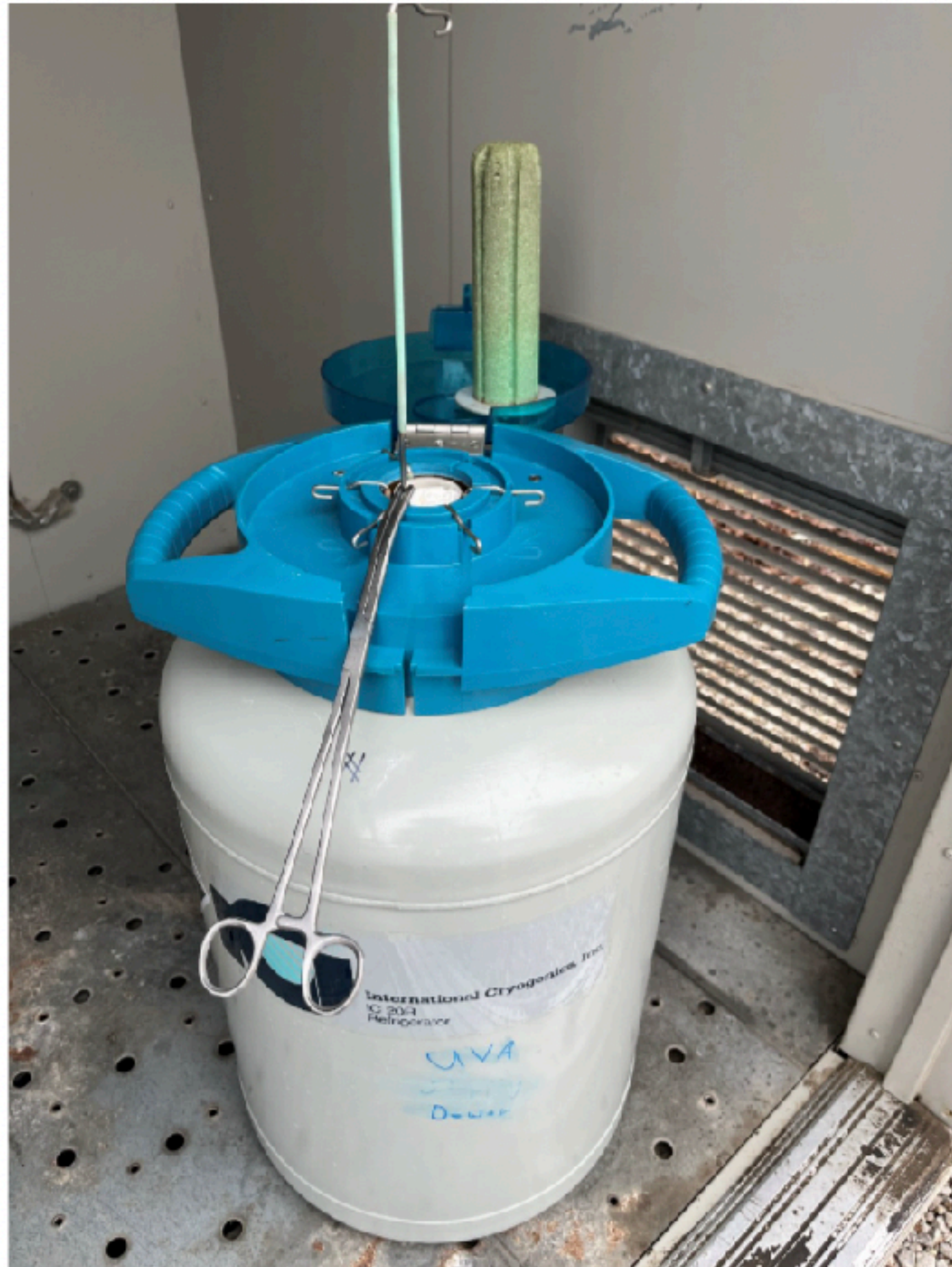
Hooked the canister in the storage Dewar with tweezers