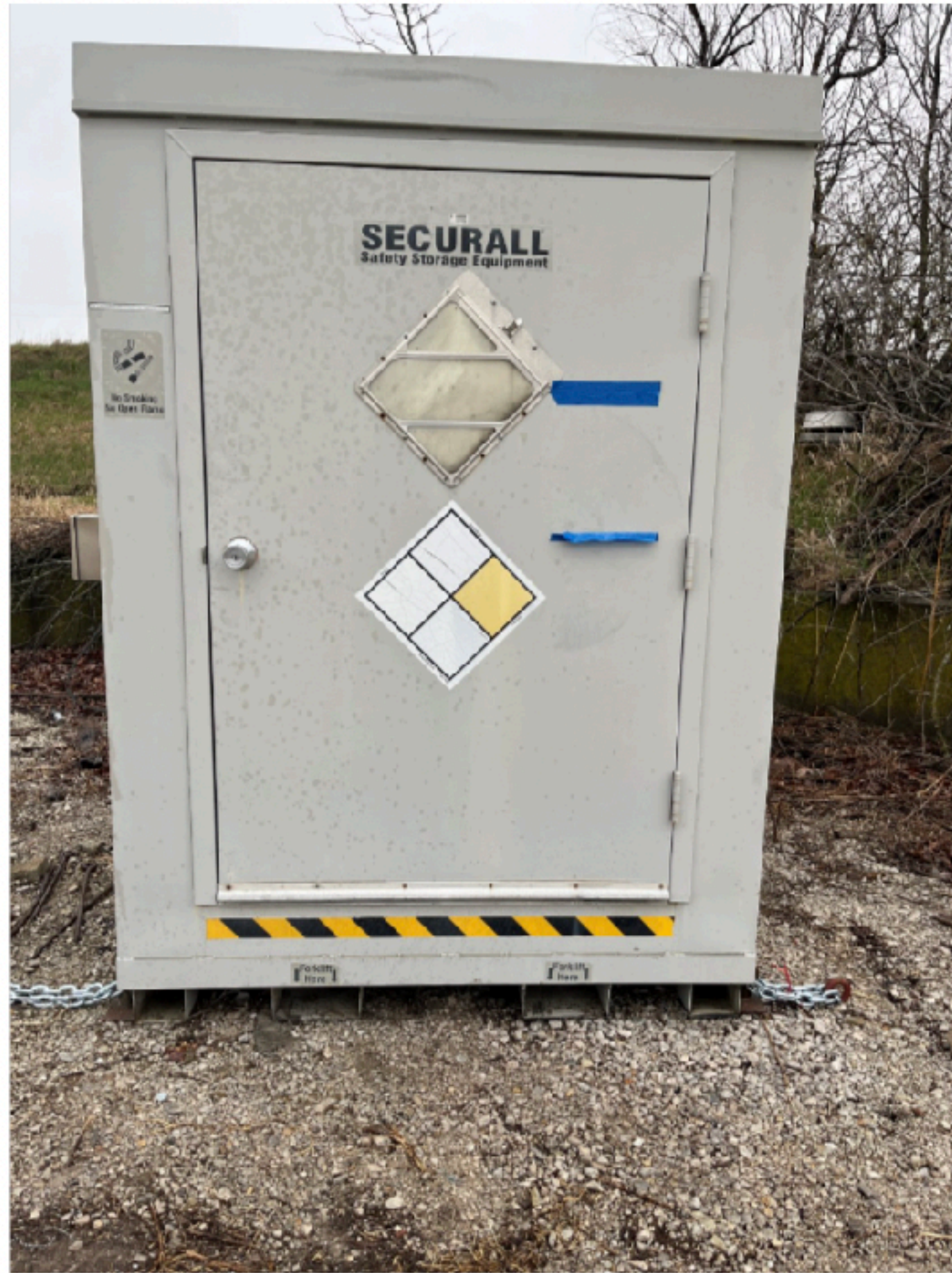
Outside Storage Shed