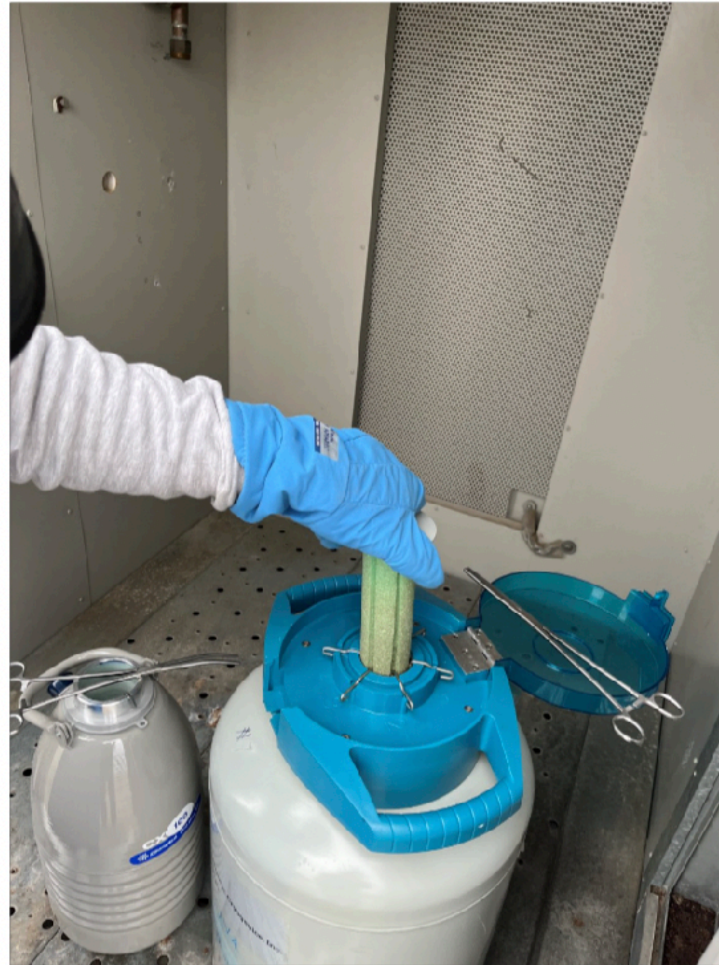
Putting cap on the storage Dewar