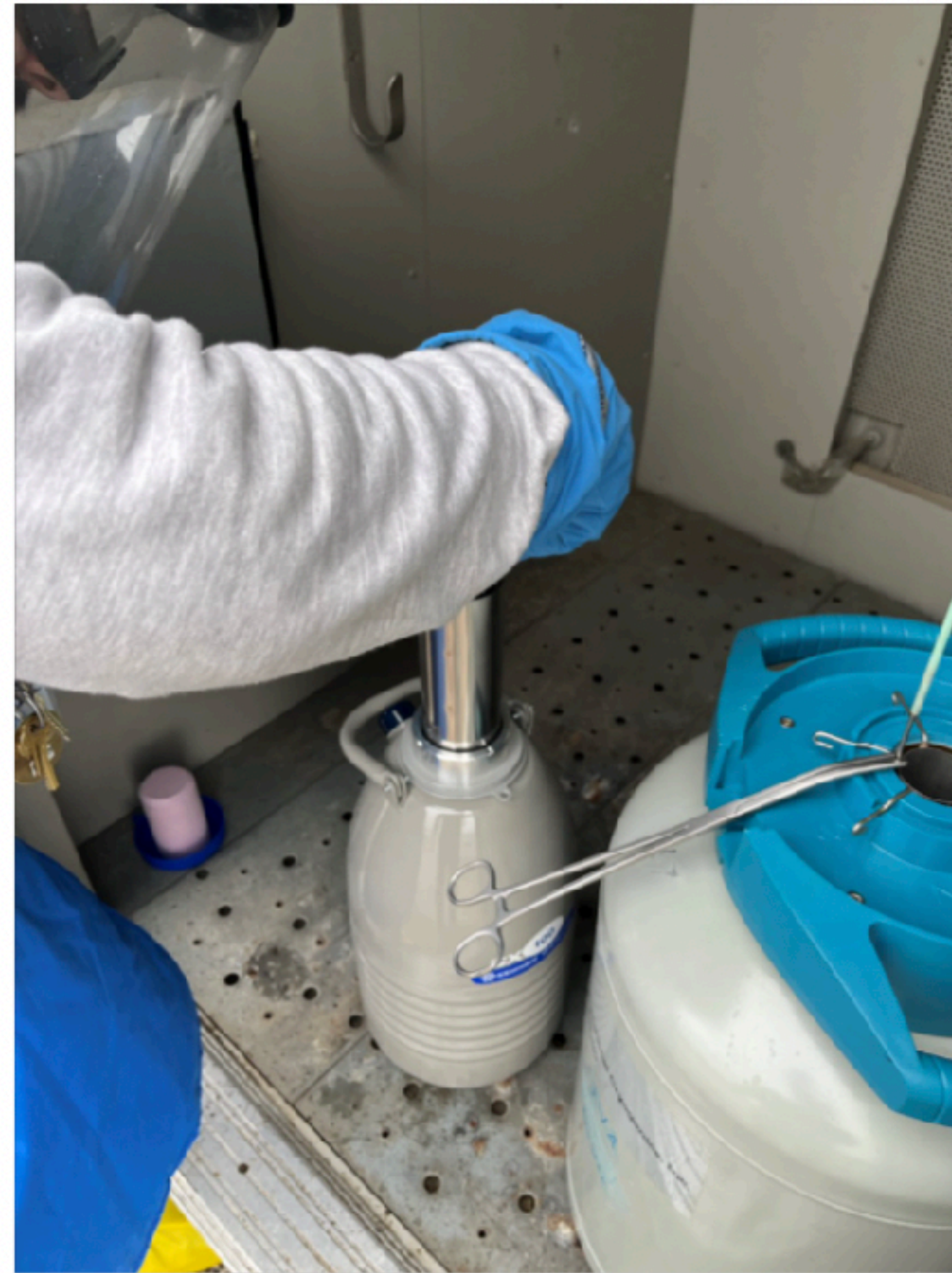
Taking out the canister from the shipping Dewar