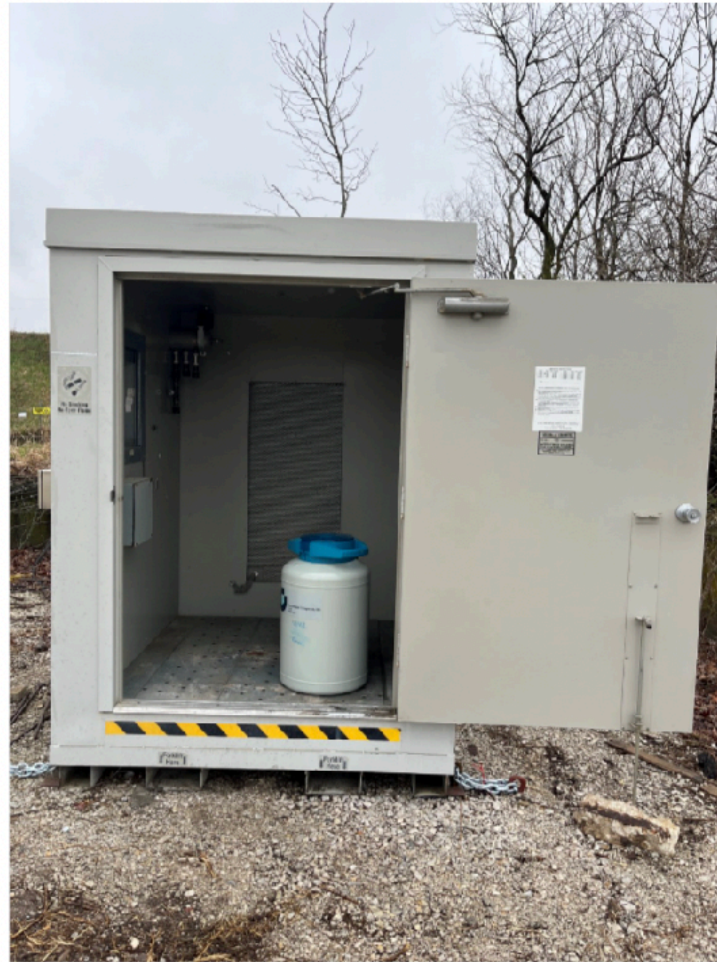
Storage Dewar in the storage shed