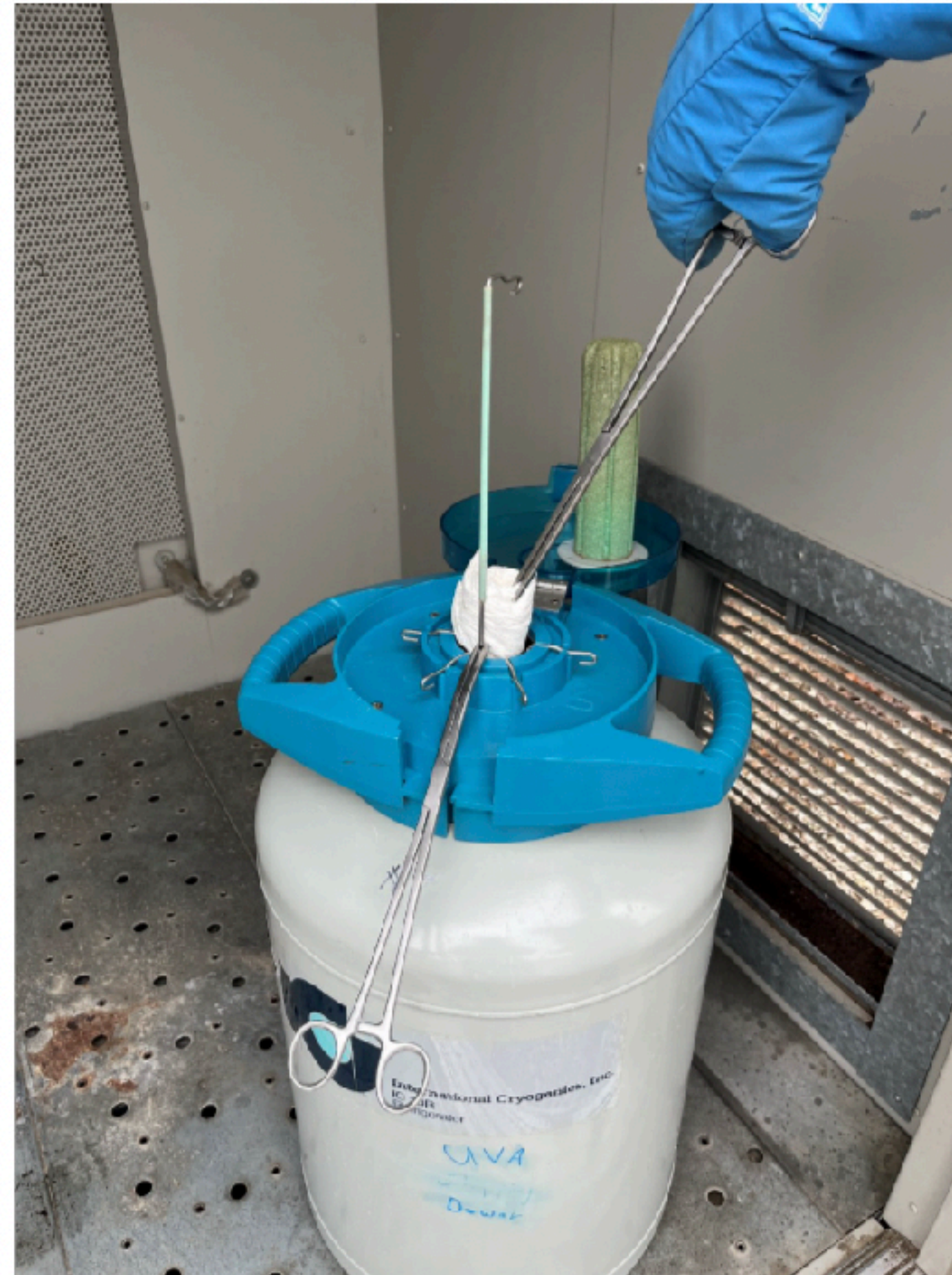
Removing paper towel from the canister