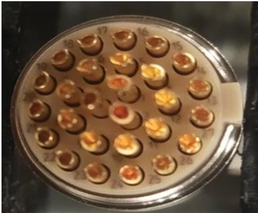
Back View of Fischer Connector

Don't consider the colored lines (Red + Blue)