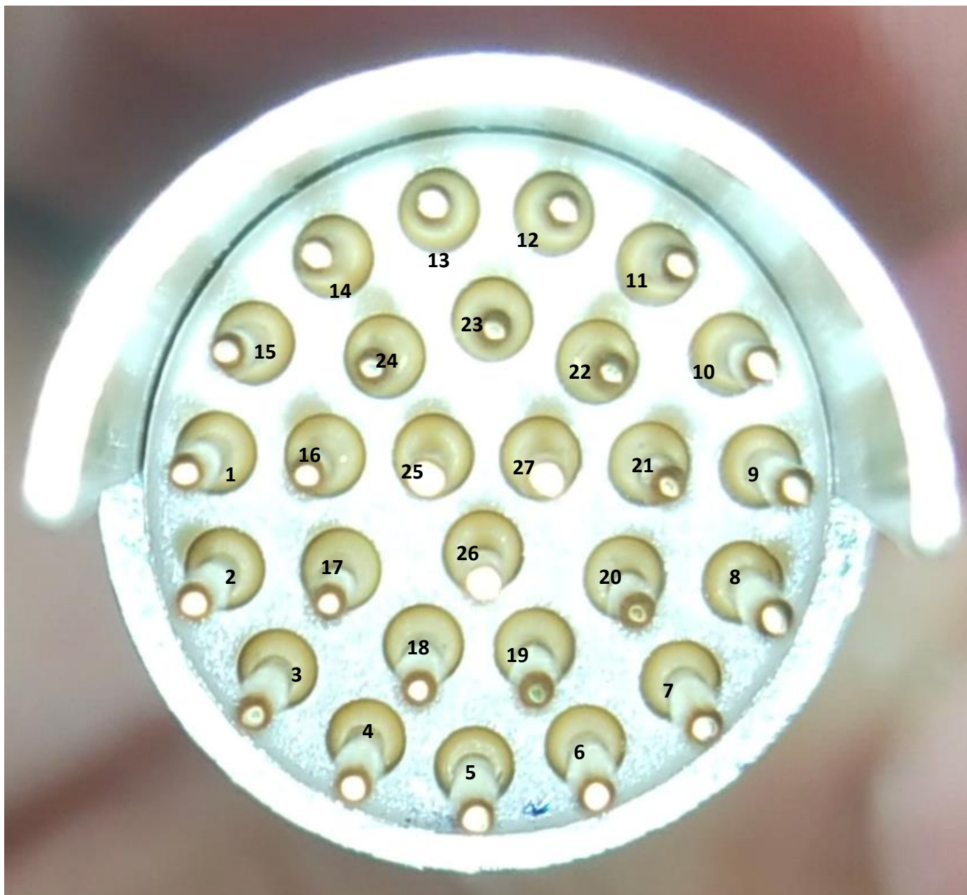
Front View of Fischer Connector